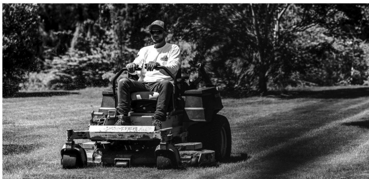
Annual Landscaping Packages