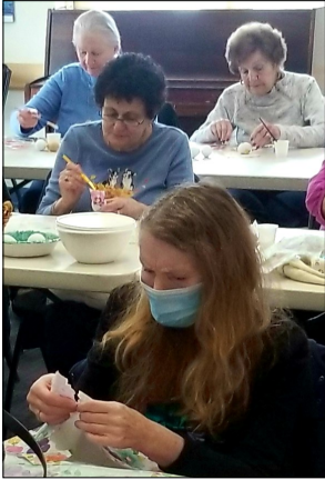
Attendees of the Egg Decoupage Workshop, provided by Hamden Rehabilitation and Health Care Center, create beautiful eggs utilizing the versatile technique of decoupage.

Lunch & Learn: Staging 101 - enjoy your home now & when you are ready to sell.