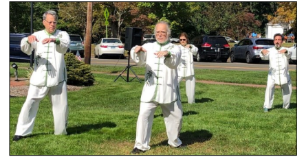
Performance at last year's Woodbridge Like Me Day.

new residents are invited to a New Resident Welcome meet-up on the Town Green at 10:30 am. The meet-up is organized by the ad hoc Woodbridge Community Council.