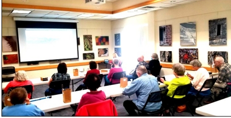
A deliciously entertaining Taste of VT program presented by Hamden Health was enjoyed by all!

Free Updated Lifestyle Change Program - in-person and on Zoom: Join this updated evidence-based Lifestyle Change Program led by a certified lifestyle coach. The program, for those over age 60, now will have guest speakers and includes 16 weekly sessions on Tue. from 1-2 pm in Rm. 16 followed by 7 bi-weekly sessions on disease prevention, weight loss, stress manage-