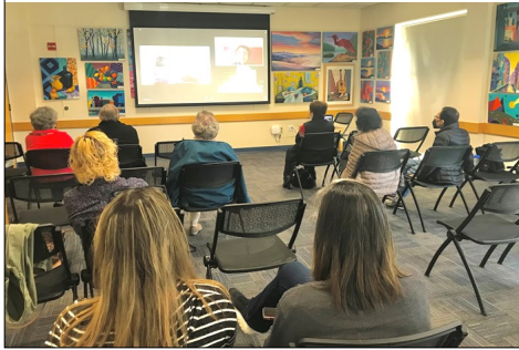
Participants enjoy the Wadsworth Museum's Virtual Art Tour: Women Artists: A Women's History Month Spotlight

Free in-person Virtual Art Tour Series viewing co-hosted with the Woodbridge Town Library: Experience art history via the oldest public art museum in the US. Come view the Wadsworth Virtual Art Tour series. Each tour will feature a different docent-led theme. Call 203-389-3430 to register. The two remaining tours in the series include: 4/6/2022 @ 7 pm: Milton Avery: A Special Exhibit (Center Building, Rm. 16). 5/11/2022 @ 1 pm: Impressionists (in the Library's Meeting Room).