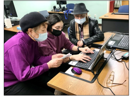
An Amity High School volunteer assists a Woodbridge resident on the laptop during a Tech Tuesday session.

Free in-person Virtual Art Tour Series viewing co-hosted with the Woodbridge Town Library: Experience art history via the oldest public art museum in the US. Come view the Wadsworth Virtual Art Tour series. Each tour will feature a different docent-led theme. Call 203-389-3430 to register. The two remaining tours in the series include: 4/6/2022 @ 7 pm: Milton Avery: A Special Exhibit (Center Building, Rm. 16). 5/11/2022 @ 1 pm: Impressionists (in the Library's Meeting Room).