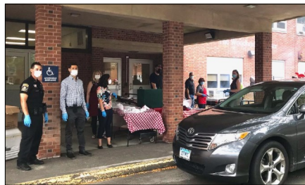
The Woodbridge Police Department helps welcome attendees with a meal fresh off the grill at the Annual "Indoor" Picnic on July 29.

Annual Town-wide Picnic: Join us on Sept. 9 (rain date Sept. 10) as Coachman Square of Woodbridge in partnership with The Center gives back to the community they call home. Town residents,