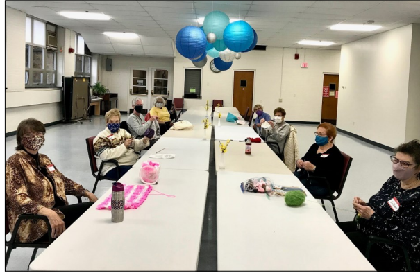
The Thursday Craft group met indoors for the first time since March 2020.

The programs below will meet in the Grove Canopy . During inclement weather, programs will meet in the Center Building gym.