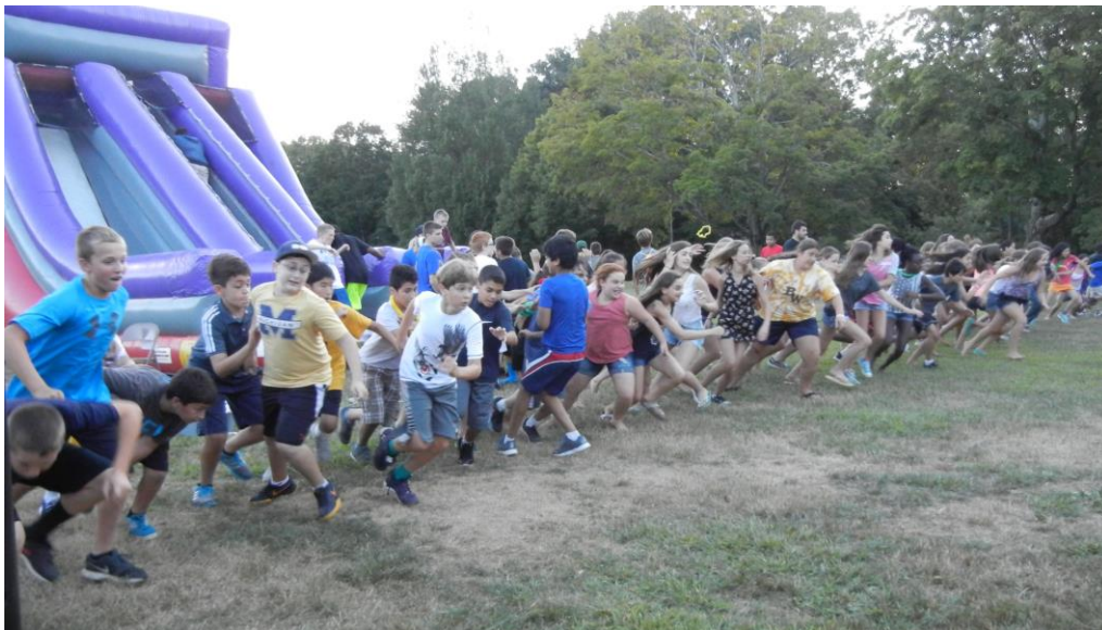
Woodbridge Youth Services hosts a picnic for Woodbridge and Bethany students to meet before entering 7 th grade together.

Woodbridge Government Access Television records and broadcasts many of the Town's board and commission meetings. Live meetings and recordings can be watched on Channel 79 (Cablevision), Channel 6109 (Frontier) or on WGATV's YouTube channel WGATV79.