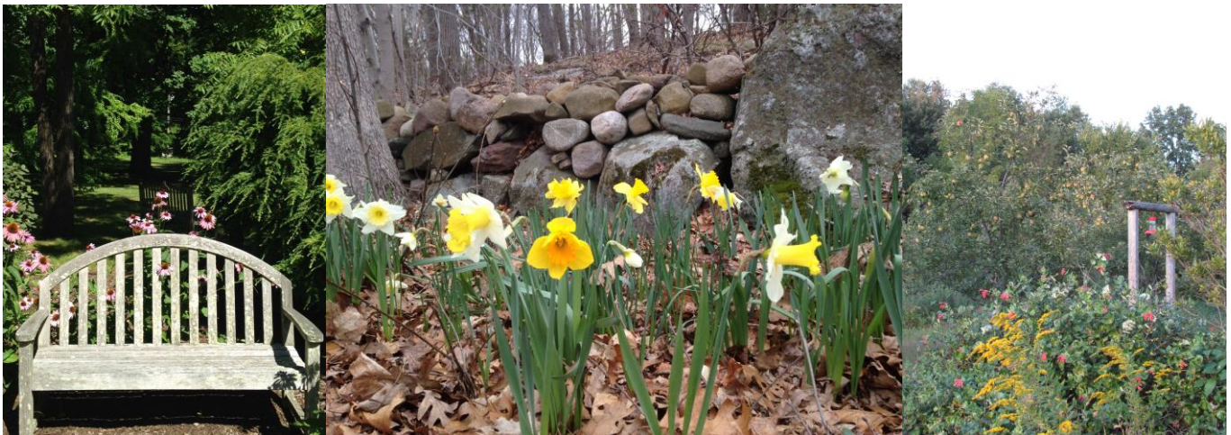
Woodbridge is known for its natural beauty and preservation of open space.

*For trail maps, visit Town Hall or the Recreation page on the Town website ( www.woodbridgect.org ).